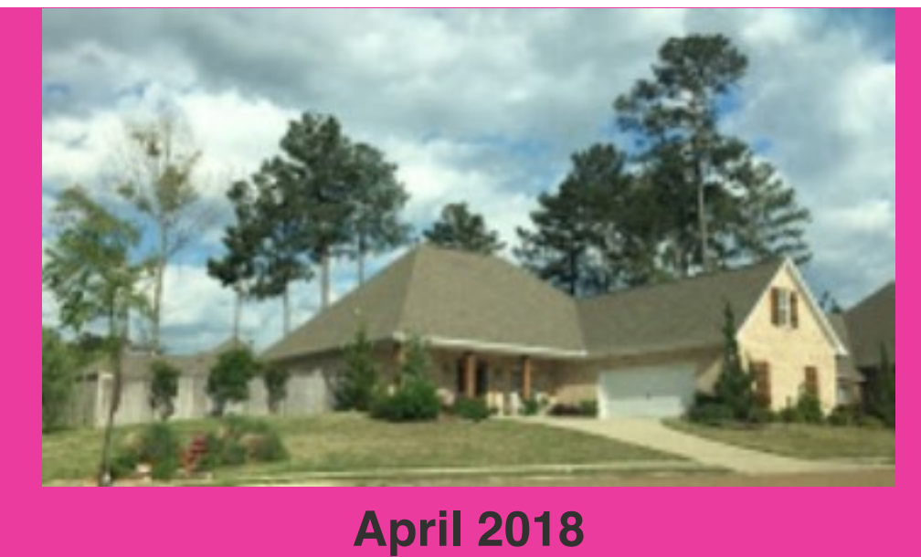
Yard of the Month